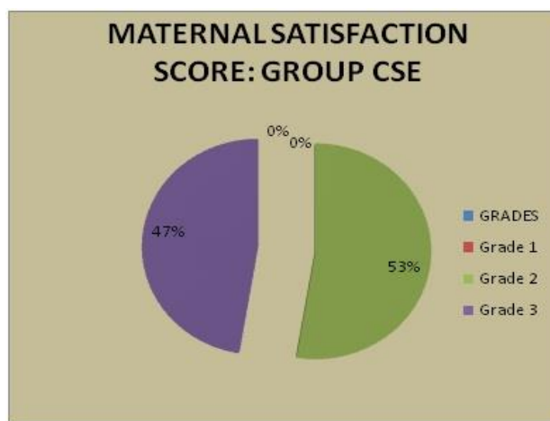
Fig. 1: Maternal satisfaction score CSE

The data of * 3 patients in epidural group and †1 patient from CSE group were excluded from analysis as they require LSCS.