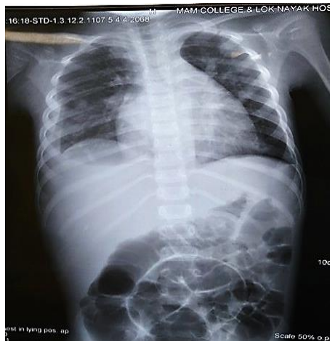
Fig. 2: Chest X ray