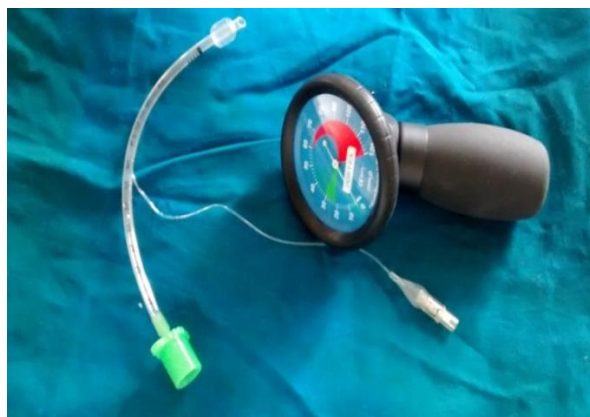
Fig. 1: Microcuff paediatric endotracheal tube and pressure transducer

ventilation. (5,6,7) With MPPT, cuff was inflated using pressure manometer(Fig. 1) to sealing pressure of 20 cm of H 2 O or till the leak stopped whichever was attained earlier. At 20cm of H 2 O of cuff sealing pressure, if still air leak was present tube was judged to be small and exchanged for next larger size(+0.5 mm). Minimal cuff pressure required to seal the airway and quality of sealing was recorded. Immediately after intubation, with either of the tubes if there was no audible air leak, the tube was judged to be bigger and exchanged for one smaller size(-0.5 mm). If there was excessive air leak with uncuffed tracheal tube not allowing adequate ventilation, it was exchanged for next larger size. Further, number of TT exchanges to find the appropriate-sized tube was recorded. Patients were maintained on O 2 , N 2 O, Inj. Atracurium 0.1mg/kg and volatile anesthetics. At the end of surgery patients were extubated after reversal with inj. Neostigmine and inj. Glycopyrrolate. Patients were observed for post-extubation stridor immediately, 2 nd hr and 6 th hr.