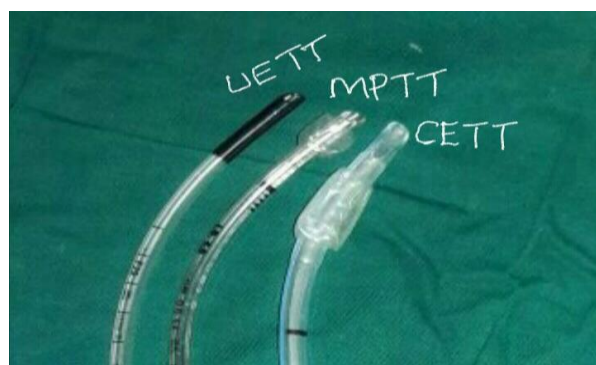
Fig. 3: Depth of cuff in different endotracheal tubes

One change with respect to Murphy eye is its deletion in MPTT thereby giving space for distal placement of cuff on the shaft of MPTT. Also cuff is designed to be short enough to provide subglottic free zone when expanded, henceforth decreasing post extubation stridor. MPTT also has facilitated proper placement of cuff because of depth markings imprinted on it.