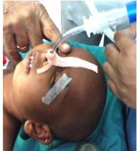
Fig. 4: Urethroscope guided 4.5 sized nasotracheal tube. Also note the retrognathia