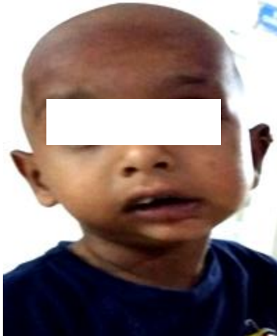
Fig. : 1 Left Temporomandibular joint ankylosis with deviation of mandible to left and retrognathia