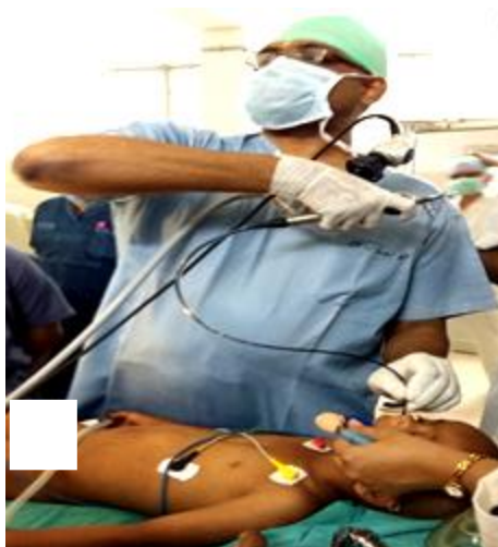
Fig. 3 Nasotracheal intubation using a flexible urethroscope.