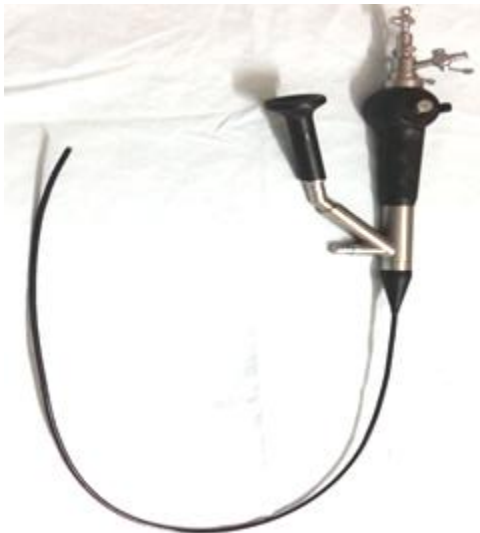
Fig. 2: Flexible fiberoptic urethroscope.