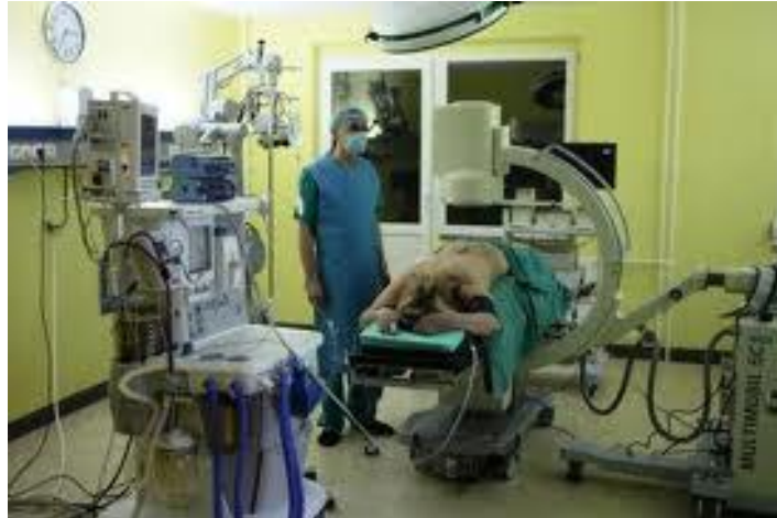
A Modern Operation Theatre with Sophisticated Monitors & Anaesthesia Delivery System.