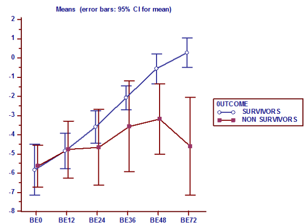
Fig. 2: Base excess levels

Serum Lactate levels amongst survivors and non survivors at different time points were compared and it was found that lactate levels from 12h time point were significantly higher in non survivors when compared survivors ( P < 0.001 ), whereas base excess levels were significantly higher ( P < 0.001 ) after 36h. Mean serum lactate levels at admission were different between survivors and non survivors ( 4.74 \pm 2.94 versus 7.27 \pm 3.90 ; P = 0.006 ). At the end of 24 hours after admission, the mean serum lactate levels normalized among survivors ( 2.27 \pm 0.83 ), whereas among non survivors the mean serum lactate levels continued to remain high ( 6.23 \pm 2.47 ). The difference in mean serum lactate levels in the survivors and non survivors at 24 hours after admission was significantly different ( P < 0.001 ). Predictive ability of Lactate and Base excess was determined by Receiver operating characteristic (ROC) curves (Table 1, 2).