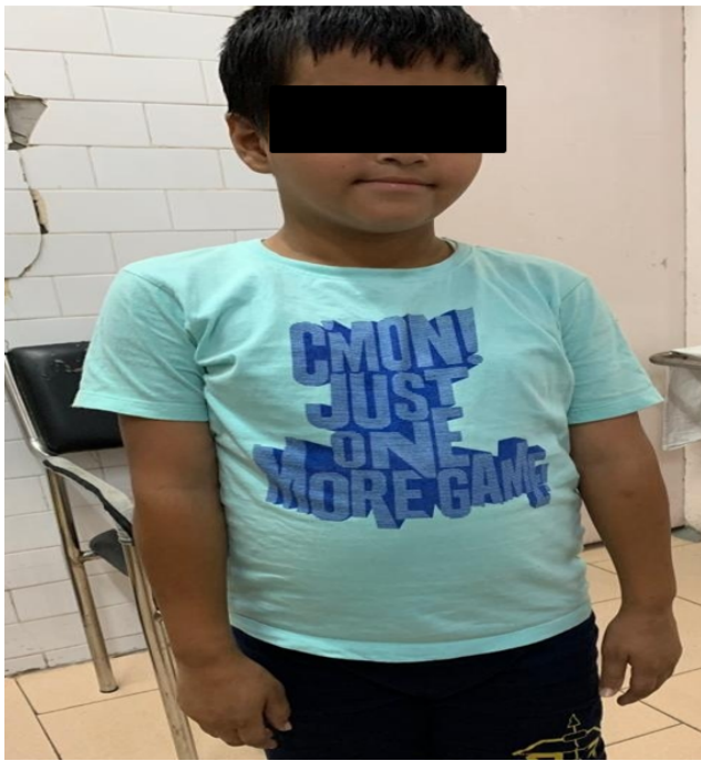
Figure 1: Picture of the child with Clark-Baraitser syndrome

Investigations included a two-dimensional echocardiogram that showed normal left ventricular systolic function with an ejection fraction of 60%. Haematological and biochemical tests were within normal limits. Abdominal ultrasound revealed fatty liver changes. MRI of the brain showed bilateral ventricular dilation, absence of the septum pellucidum, right medial temporal sclerosis, bilateral frontal atrophy, and a partial empty sella.