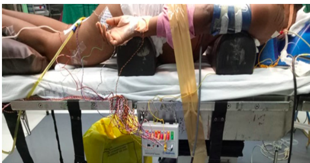
Figure 1: SSEP and MEP monitoring being done using subdermal needle electrodes placement