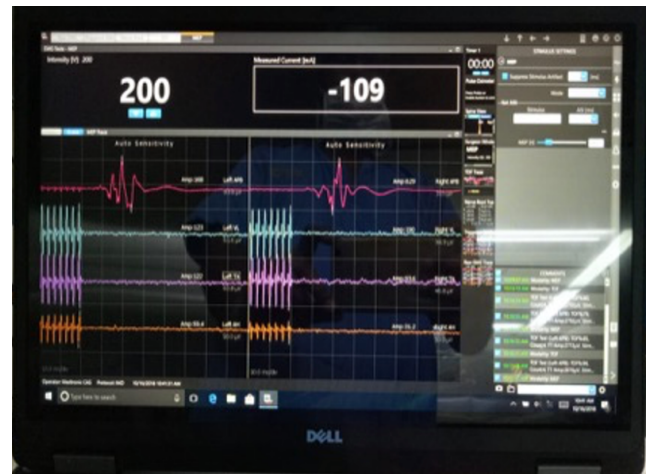
Figure 2: Baseline sensory and motor evoked potentials were elicited with good amplitude and morphology

For intraoperative neuromonitoring, inhalational anaesthetic agents can have a less but still noticeable impact on