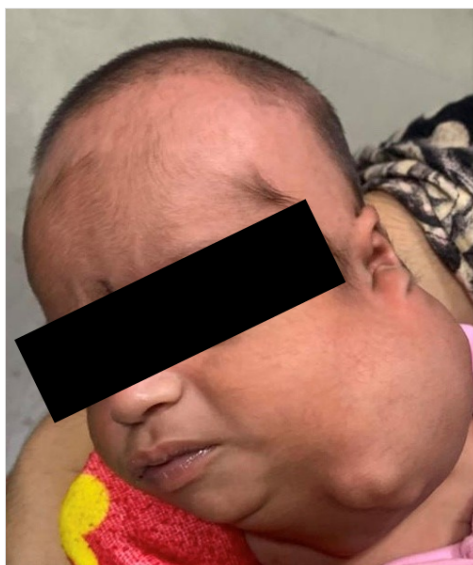
Fig. 1: Large lymphangioma covering left neck-preop