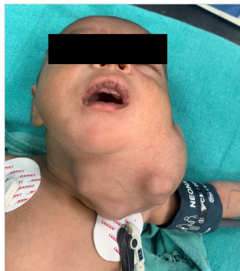
Fig. 3: At the time of induction

Blood loss was approximately 100 ml and was replaced. The duration of surgery was 2 hours. At the end of the surgery, neuromuscular blockade was reversed with injection neostigmine (0.05 mg/kg) and glycopyrrolate (0.01 mg/kg) and patient was extubated. Patient was shifted to post-operative care unit for observation and nursed in lateral position.