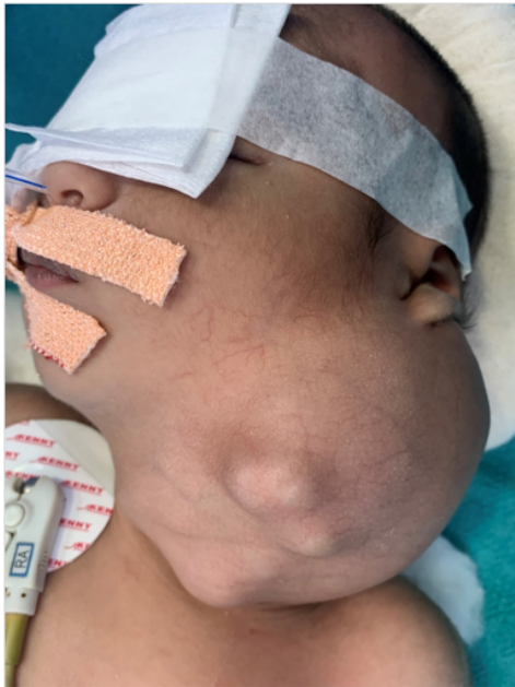
Fig. 4: Post induction

syndrome, Noonan's syndrome, and fetal hydrops. 7