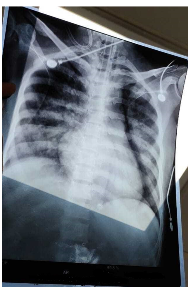
Fig. 2: Antero-posterior chest X-ray showing bilateral diffuse reticular opacities suggestive of ARDS

Bilateral symmetrically diffuse reticular opacities were noted on the chest X-ray (Figure 2).